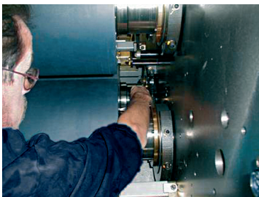
Detailed inspection of the mechanical components