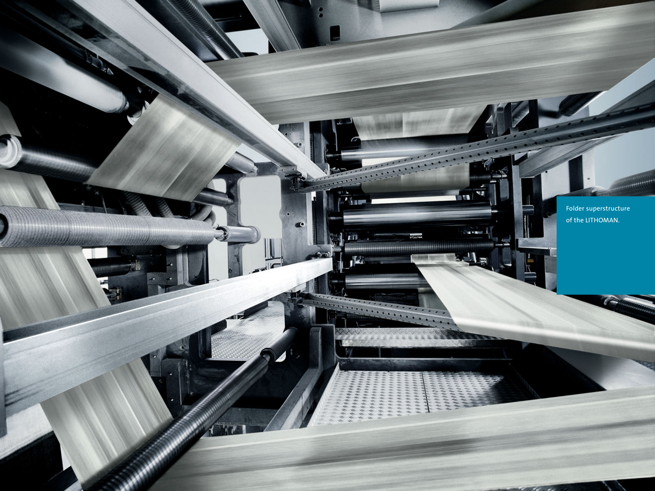
Folder superstructure of the LITHOMAN.