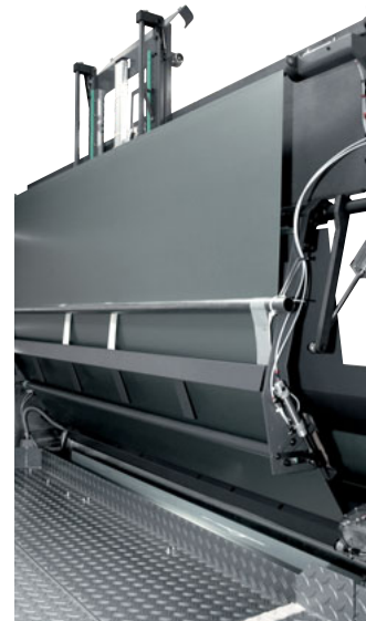
Fully-automatic plate change with APL™.

Stable performance. The LITHOMAN not only achieves its maximum values at peak times. The innovative printing system operates successfully at full speed in hundreds of printing plants – 24 hours a day, 7 days a week.